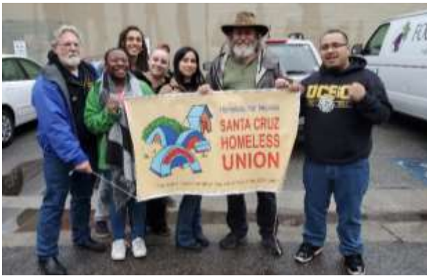
Homeless Union stands with striking students

The University has responded with police violence and threats to terminate those who are on student or work-related visas, knowing full well that by so doing, they may be subject to deportation. Over 18 students have been arrested, many clubbed, beaten and injured by officers from at least five different police and sheriffs departments from as far away as 100 miles. Students who are arrested face immediate suspension without any prior due process. On the third day of the expanded strike, hundreds held the picket lines for four hours, forcing police to finally retreat.