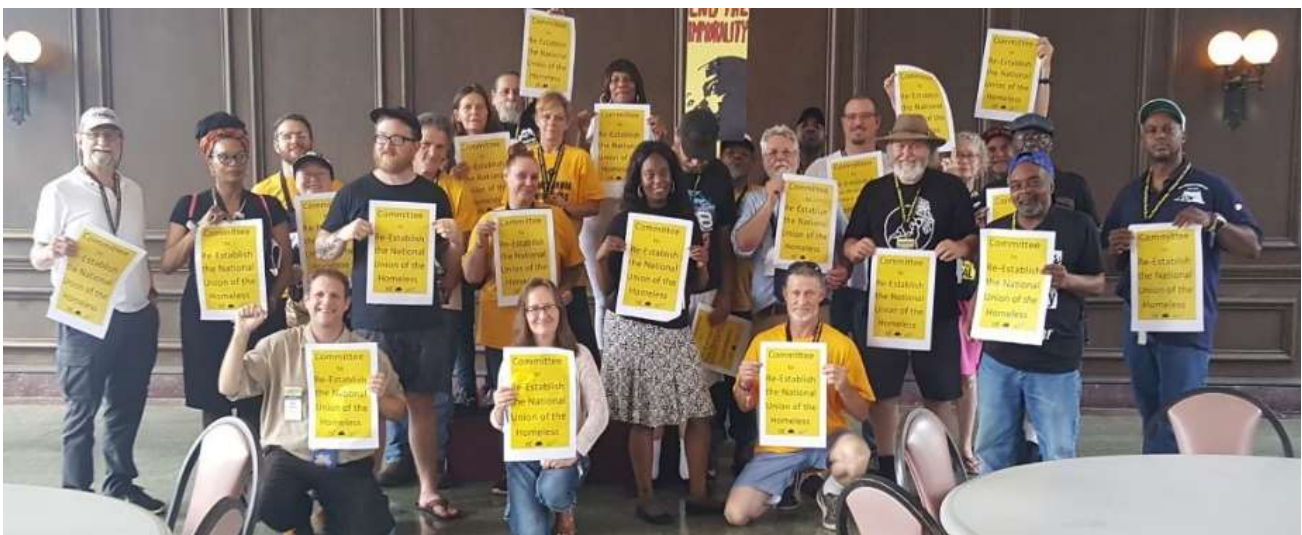
Executive Council, National Union of the Homeless

Visit our facebook page at : www.facebook.com/NationalUnionoftheHomeless